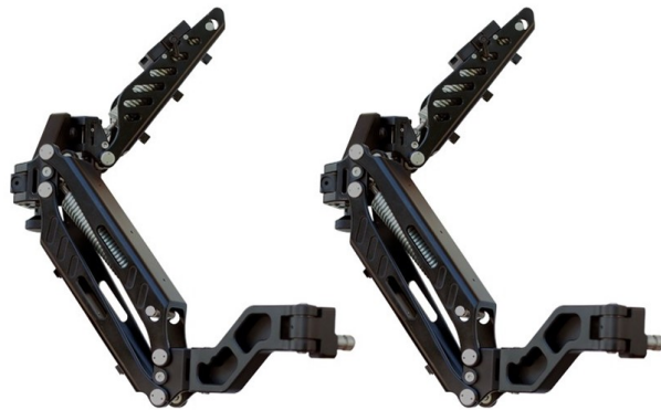
2 x Seagull Arms