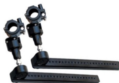
Movi Hand-Grip Support Brackets