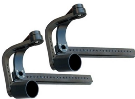
Ronin Hand-Grip Support Brackets